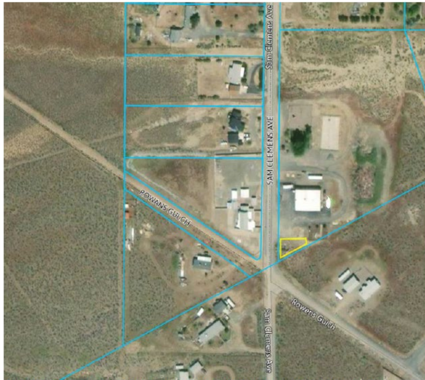
Mark Twain area – signs must be located a minimum of 100-feet from the entrance to the polling location.