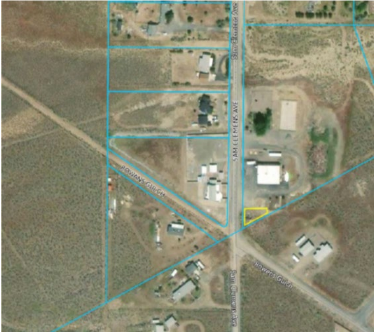
Mark Twain area – signs must be located a minimum of 100 feet from the entrance of a polling location.