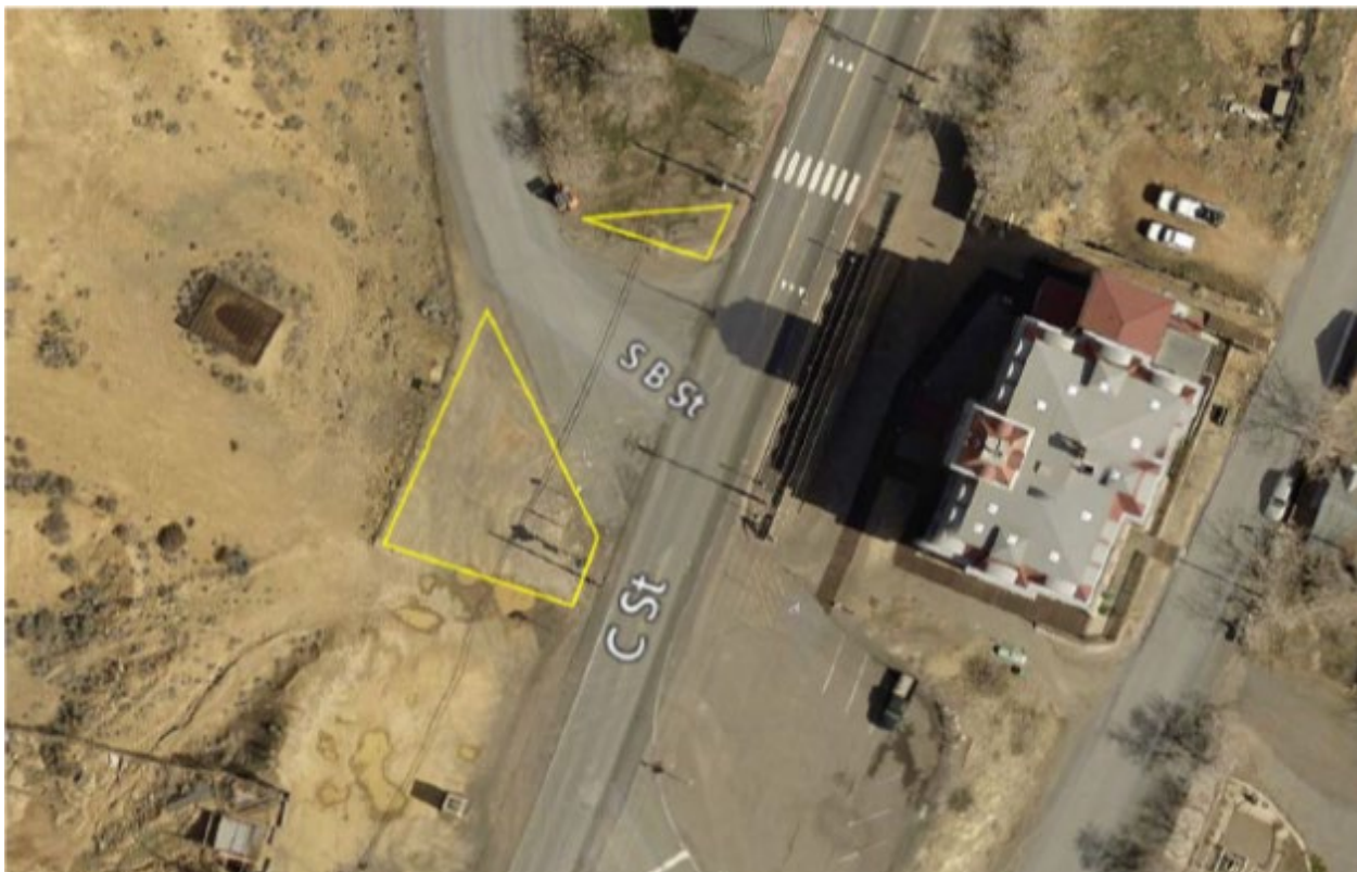
North C Street, Virginia City